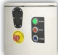
Visual control panel