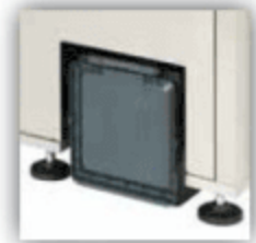
Bin location within the footprint

Higher capture rate - High capture rates improve the quality of the "grey water" going to drain (less suspended solid particles), aiding local water authority approval.