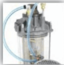
Self cleaning operation